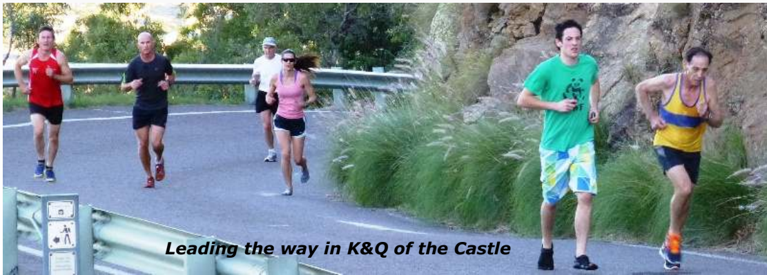
Leading the way in K&Q of the Castle